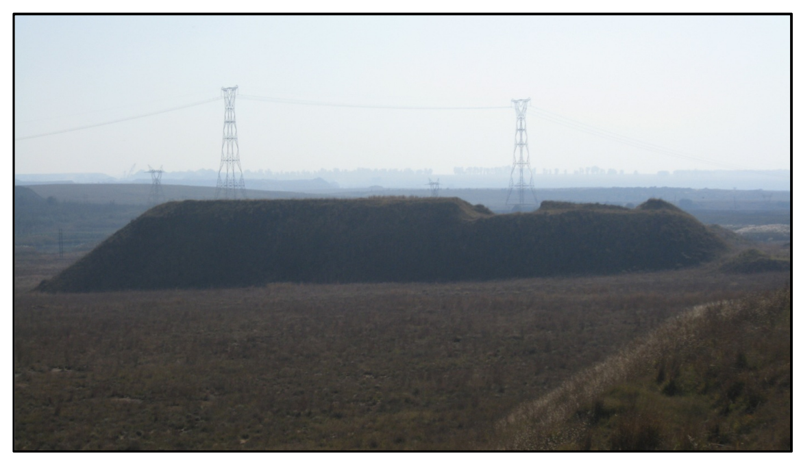
20 year old stockpile – is it useable?

A three year research project at ARC-ISCW to look into various aspects of the stockpiling of soils on open cast coal mines has recently commenced. The project is funded by Coaltech and will look at physical, chemical and microbiological aspects of the stockpiling process. While many mines now use a continuous "Cut and cover" technique that minimizes the amount of time that soil is stockpiled, this is not always the case, and some stockpiles are as old as 15-20 years. Much work has been done on the rehabilitation aspects of mine soils, but if the preceding stockpiling is poorly done, then even the best rehabilitation practices will be problematic. For information, contact the project leader Garry Paterson (garry@arc.agric.za; 012 310 2601).